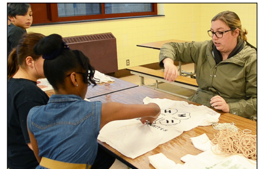
Page 1: Cooking Club making fried rice; this page: Drumming circle during Wellness Club (top); 4-H Club tie-dyeing t-shirts (bottom)