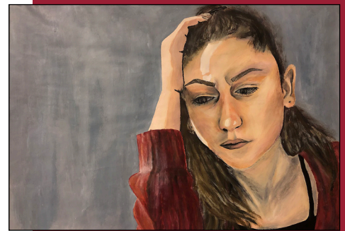
Top: "Family Portrait in Shoes"; Middle: "Idol"; Bottom: "Questioning"